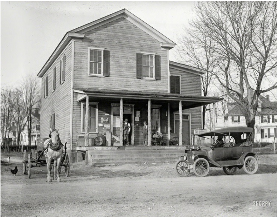
An unknown shopkeeper in an unknown locale, date unknown. A simpler time.