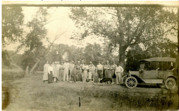
Family reunion? Church outing?