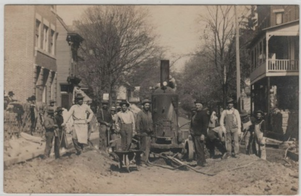
Street work, Utica, Ohio, 1908

Our Rapid Assembly Team has been invited to participate again, so we will be looking for volunteers! Mark your calendars and plan to participate in this event! It is always fun to share these times together.