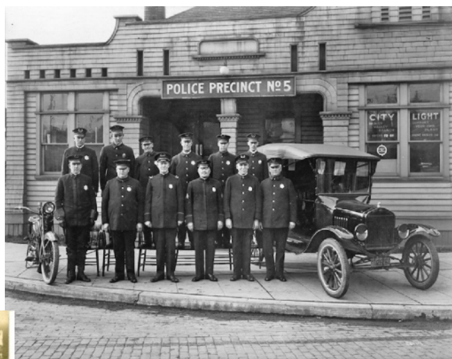
Seattle police, 1920's.