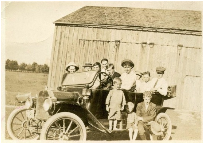
20 Horsepower, 20 people. No date.