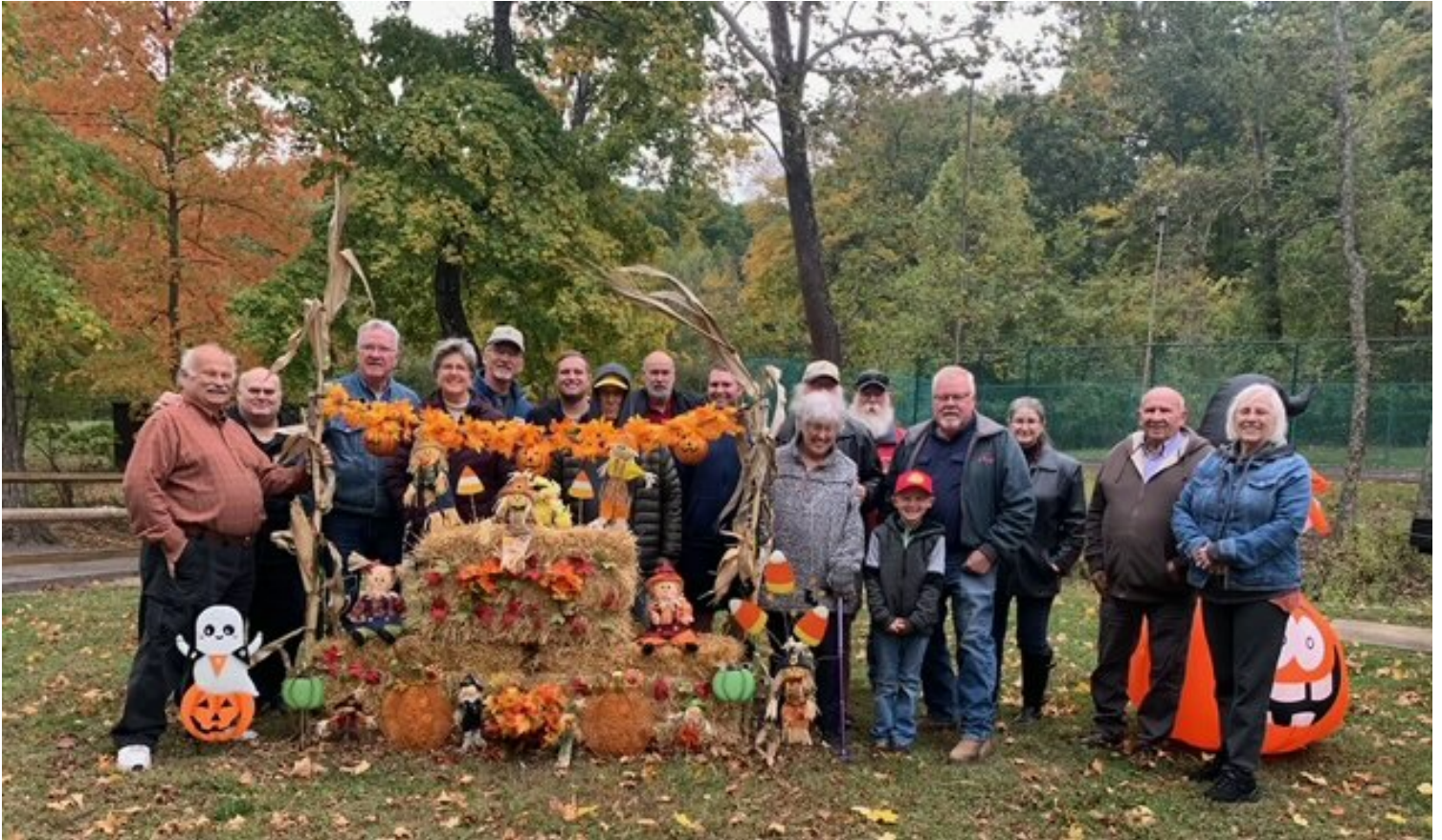
Annual Chili Cook-Off, October 15, 2023

The Model T Ford Club of America (P.O. Box 996; Richmond, IN 47375-0996) was formed to encourage and promote active interest in the Model T Ford and its history by membership unrestricted as to location. It is non-profit and non-discriminatory, and is dedicated to widening the base of the hobby by providing information, assistance, and direction to interested parties. Sample copies of their magnificent magazine, The Vintage Ford , are available free upon request at the above address. Active touring chapters are encouraged, in order to spread interest and participation events. Regional and national activities are provided by the chapters. Members of the MTFCA may be members of the Model T Ford Club of Greater St. Louis with discounted local dues. For further information on joining, see inside the back cover. Also check out our website: www.stlmodeltclub.org .