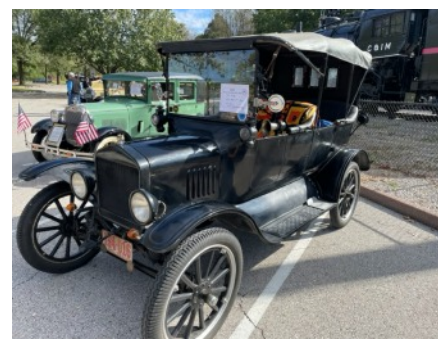
Langguth family's 1921 Touring