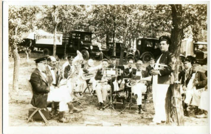
Band playing at an auto-camp, unknown location, unknown date.