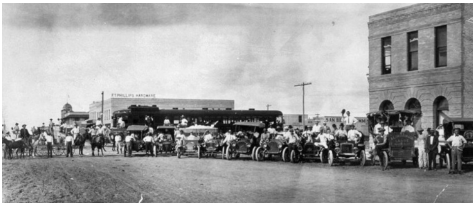
Street scene, San Benito, Texas, October 1911

There will be a cash bar. And don't forget to bring cash for raffle tickets and any other incidentals available.