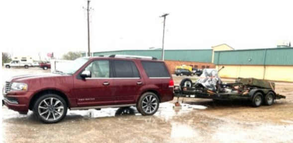
Setting up Thursday in the rain and the mud.