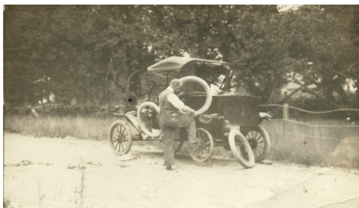
The back deck of this T indicates it is a salesman's roadster. He's changing a flat on non-demountable wheels. Always a pain in the kiester!