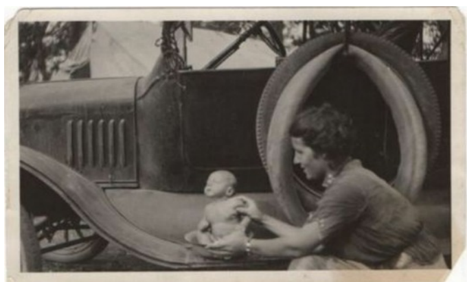
Now that warmer weather is here, and our thoughts turn to travels and tours, how about a running board baby bath for the family?