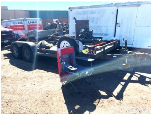
Another view of our trailers.