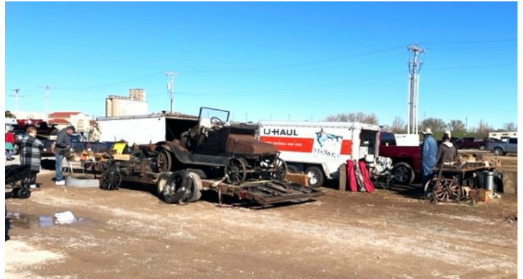
A little bit of everything available at the St. Louis Model T members "compound." We were all clustered together.