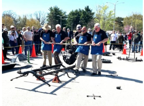
The engine being installed.