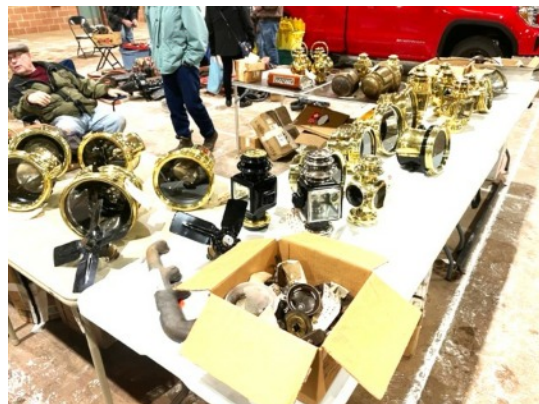
Beautiful brass lamps for sale! Just some of the offerings at the swap meet.